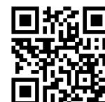
ANCHOR SYSTEM IN USE VIDEO